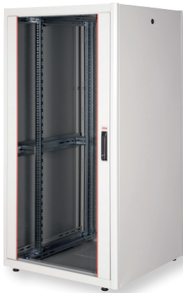
Tempered glass front door