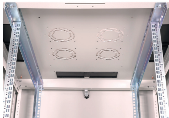
Roof with cut-outs for ventilation