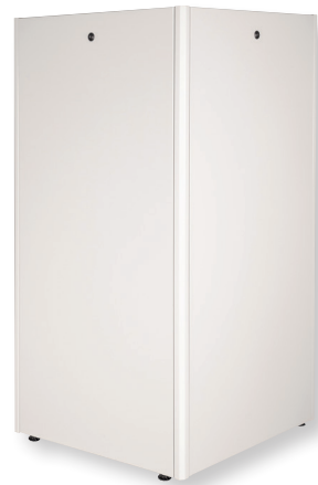
Rear panel without cable entry