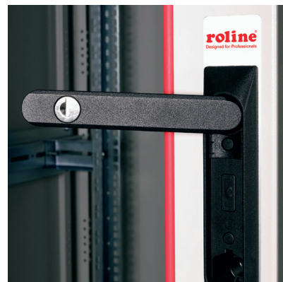
Locking system with swivel lever handle