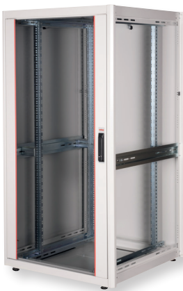
Removable side panels