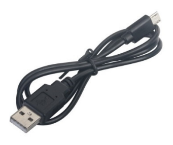
USB Power Cable